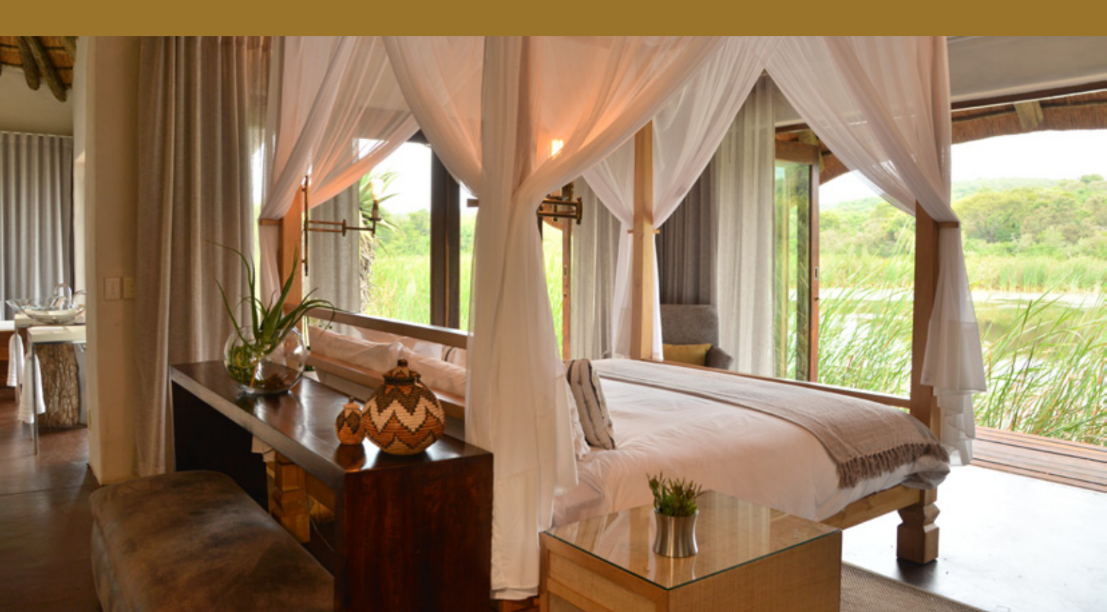
6 x double bed cottages with a bath and shower

Leadwood Lodge is truly something special. There are six cottages in total, situated adjacent to the grand Leadwood Manor House. The cottages are identical inside and are ideally used as honeymoon suites and make for special romantic getaways. Each cottage has its own private deck. THE ONE COTTAGE IS SITUATED NEAR A DAM. The rest of the cottages are surrounded by green bush. The cottages were built by a team of artisans with locally sourced shale. Leadwood Lodge combines exceptional architecture, towering thatch and resplendent finishes against a backdrop of breathtaking natural beauty. The décor is an eclectic merging of antique and organic Africa with one of a kind artistic elements. The lodge was designed on an ethic of 'nothing straight, nothing painted' and the final results are a masterpiece of earth, water, glass and hardwoods. Please note that this is not self-catering accommodation, however, mini fridges are available in the rooms.